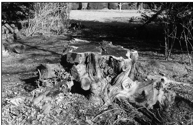
Yew's been had - the scene behind the pavilion

Group representatives will receive a copy of the newsletter and will be responsible for passing on any relevant information to the other members of their group, and they will also receive notification of and be welcome to attend all committee meetings.