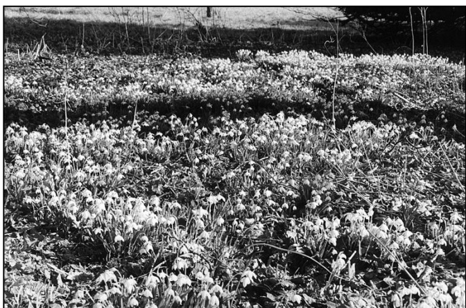
Before the ban - snowdrops under the beech tree

We are hoping that it will be possible to carry out maintenance activities on the lawns - the most pressing jobs are scarifying to remove the moss, which was sprayed earlier in the year, and mowing.