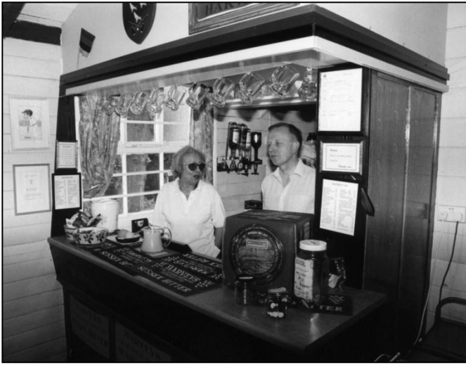
A familiar sight - the bar at Southwick.

Each county plays all the others and each match consists of three games of doubles played to advanced rules with three-hour time limits. The combined handicaps of the first pair must be less than those of the second pair, which in turn must be less than those of the third pair. The lawns were fast, the hoops both tight and solid, so it was hard going.