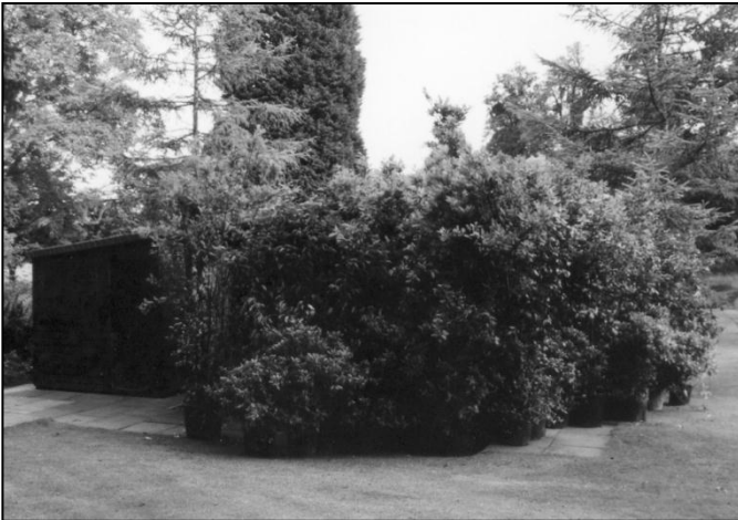
It's a jungle out there - the pavilion camouflaged for filming

Wrest Park was recently invaded by a production company filming an advertisement for a new stores loyalty card. One of their first moves was to partially surround the pavilion with greenery (some might think this a distinct improvement).