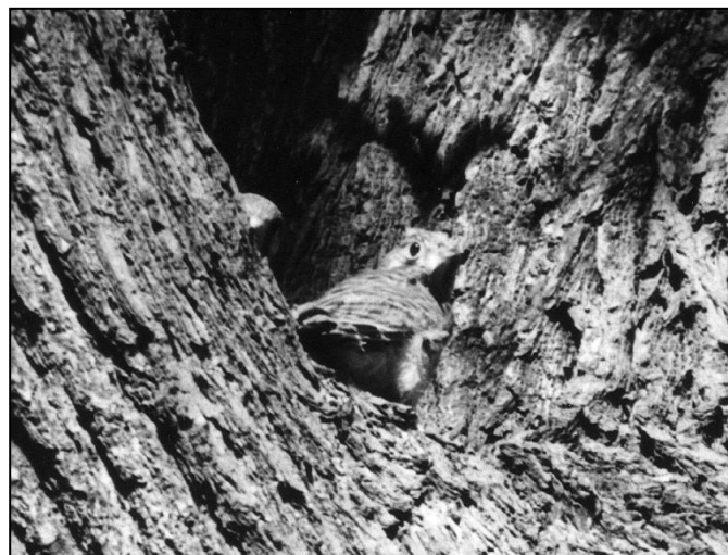
Babes in the wood - two of the three kestrel chicks recently raised in the oak near the lawns.