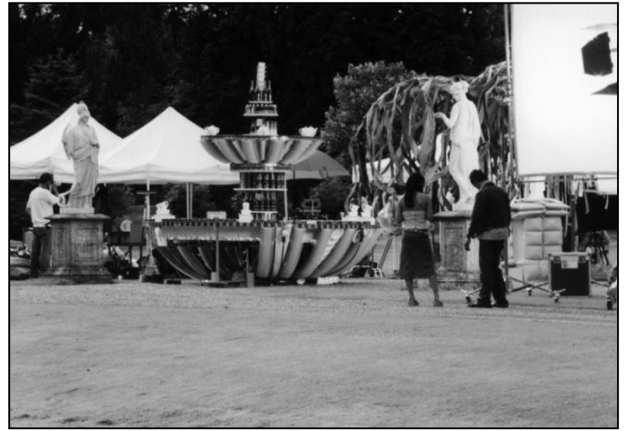
Points mean prizes - the centrepiece topped with cups and saucers

We don't know when, or indeed if, the results will appear on your TV screens, but if it does keep your eyes peeled and you may spot some familiar figures.