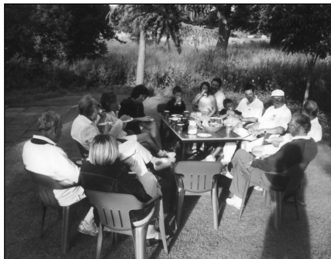
The Pro-Am tea interval, with the photographer in shadow