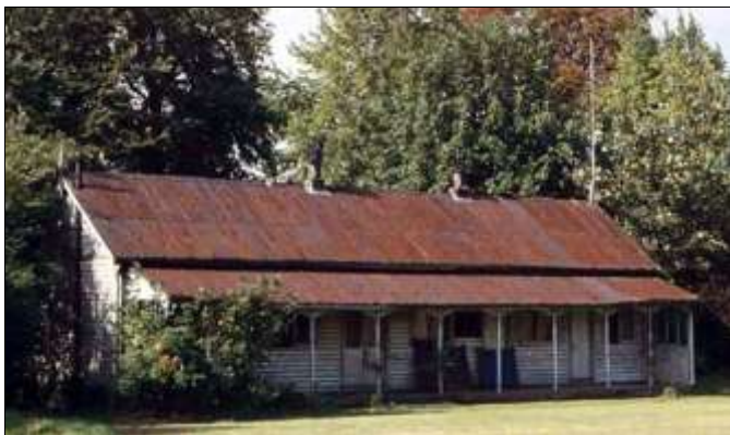
The Bedford Croquet Club pavilion