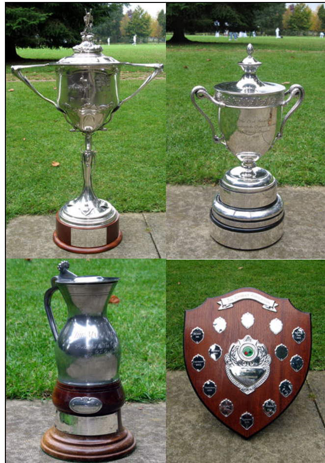
Points mean prizes, and here they are. Clockwise from top left (not to scale) are the Beddow Cup, the Longman Cup, the Inter Club shield and the Mary Rose tankard.

The teams for the Club Finals weekend came from all points of the croquet compass: Bowdon, Pendle & Craven and Fylde from the north, Woking and Surbiton from the south, Dyffryn and Bristol from the west and Norwich from the east. No matter what route they took, they all managed to negotiate the various gates and padlocks and arrive in good time. The event takes place when many players might think the season to be already over, with the dew hanging on until lunchtime and the light rapidly failing in the early evening. Even though the sun may have struggled to show itself through the cloud the weather remained dry and reasonably warm throughout, with barely a breath of wind.