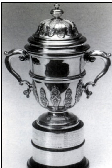
The Spencer Ell Cup

to the CA in his will, with the request that some of it should go towards a better trophy for the Surrey Cup, which was renamed the Spencer Ell Cup in 1973.