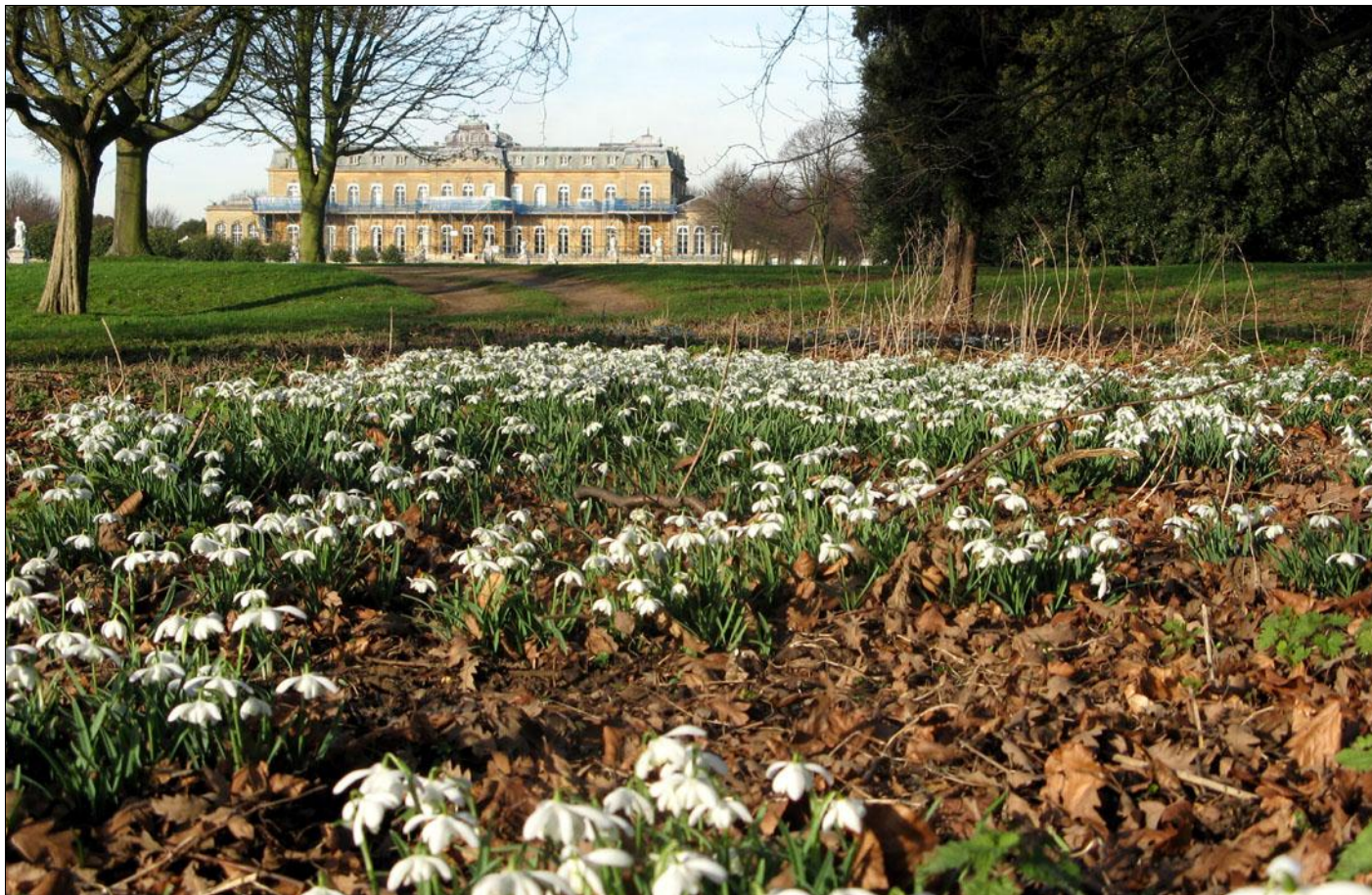
Three secondary colours to the fore on a spring-like early February afternoon.