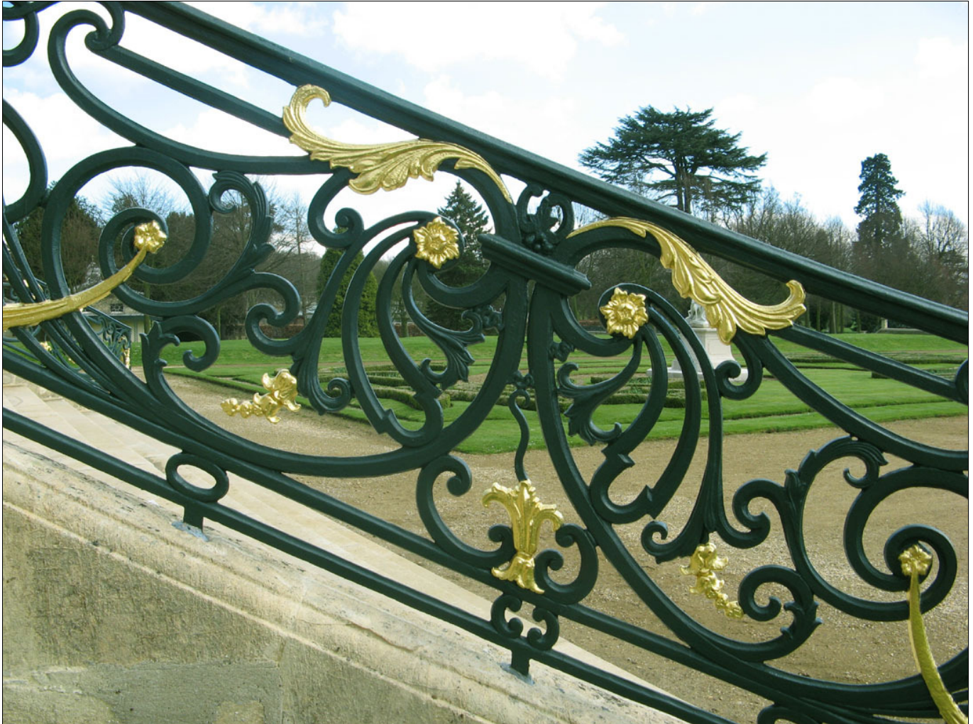
Late English rococo – a detail of the balustrade on the south front steps, resplendent in fresh green and gold livery.