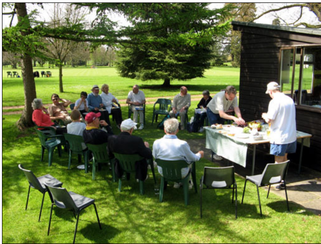
Highlight of the Social Day – the luncheon interval.