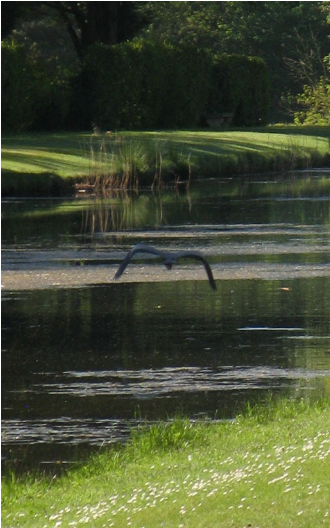
A camera-shy heron taking off across the Long Water on the Sunday of the May tournament.