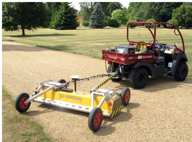
The radar scanner with its towing vehicle.

The screen image above shows part of the area between the lawns and the fountain: It may be that when the report is published we will discover the reason for the valley running down the side of lawns 1, 3 and 5.